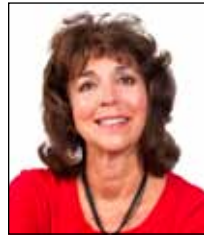
TONI KING HEALTH

Don't stress yourself about the Medicare Open Enrollment (OEP), aka Annual Enrollment Period (AEP), that begins Oct. 15, because you will be in your Medicare Initial Enrollment Period (IEP). This is Medicare's special time for those