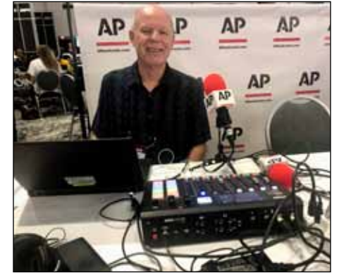
Podcasting from Radio Row prior to Super Bowl LIV in Miami in 2020.

We had guests from Emeril Lagasse to John Smoltz to Tom Izzo and had a blast with almost every one of them. It helped that we were