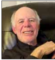
TIM DAHLBERG SCS LIFE COMMENTARY

If I was feeling restless late at night I'd turn the AM dial to a